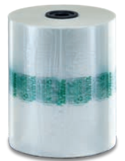
Heavy Duty (26 μ)