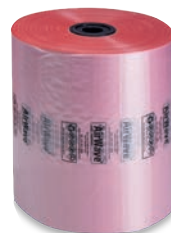
ESD (20 μ) antistatic