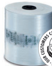
Climafilm (20 μ) Climate neutral