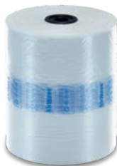
ECO (15 μ)