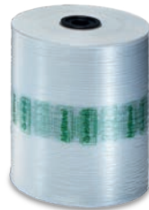
Super ECO (12 μ)