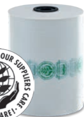
BIO (20 μ) Home-compostable