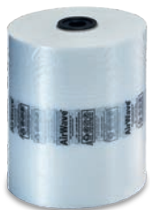
Standard (20 μ)